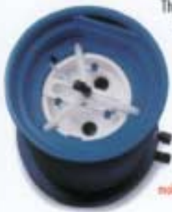
molded polyethylene spray manifold

The HTH Pulsar 3 Chlorinator is used with a timer or any ORP-based pool automation unit. The easy to maintain HTH Pulsar 3 Chlorinator uses a unique spray concept that enhances your pool's filtration system, helping to make your pool water sparkle. A 1/4 hp pump provides 27psi through the venturi for optimal evacuation of the chlorinator.