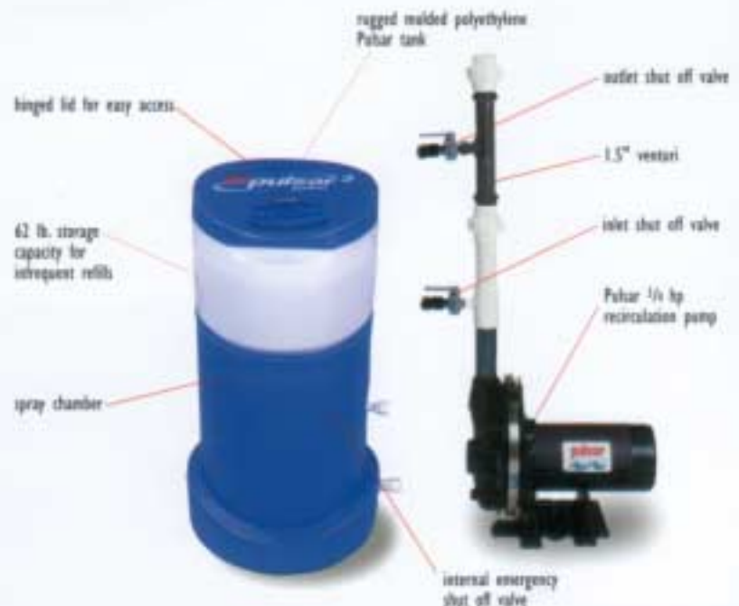
rough molded polyethylene Pulsar tank outlet shut off valve 1.5" venturi inlet shut off valve Pulsar 1/4 hp recirculation pump internal emergency shut off valve spray chamber 62 lb. storage capacity for infrequent refills hinged lid for easy access