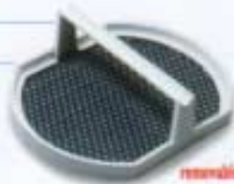
removable spray chamber grid

The NSF listed HTH Pulsar 3 Chlorinator provides consistent, dependable pool water chlorination and is capable of very high chlorination rates.