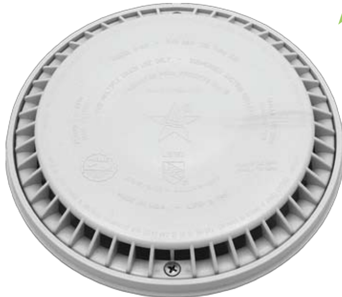
Model # 8AVxxx